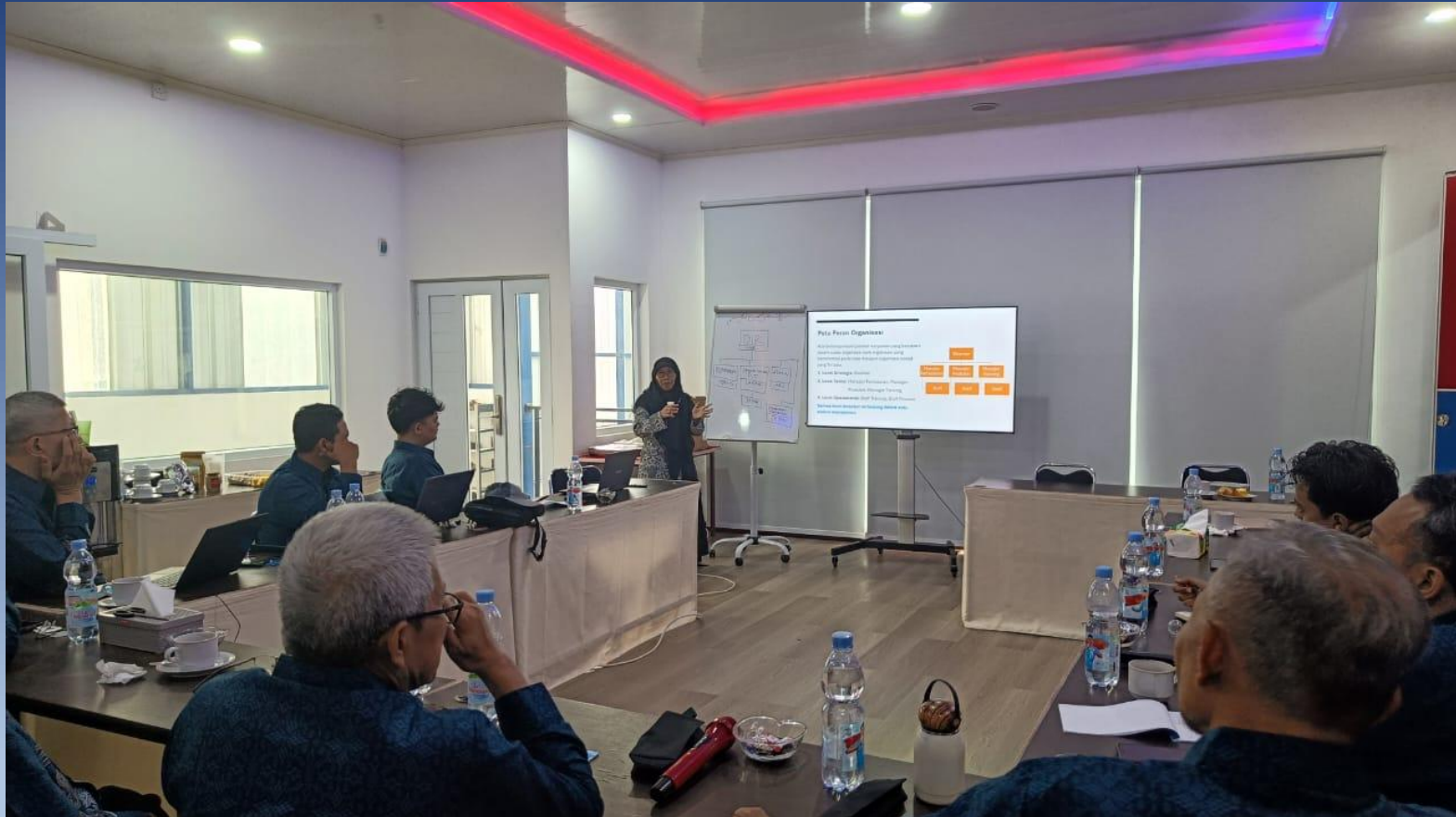
Management and Corporate Development