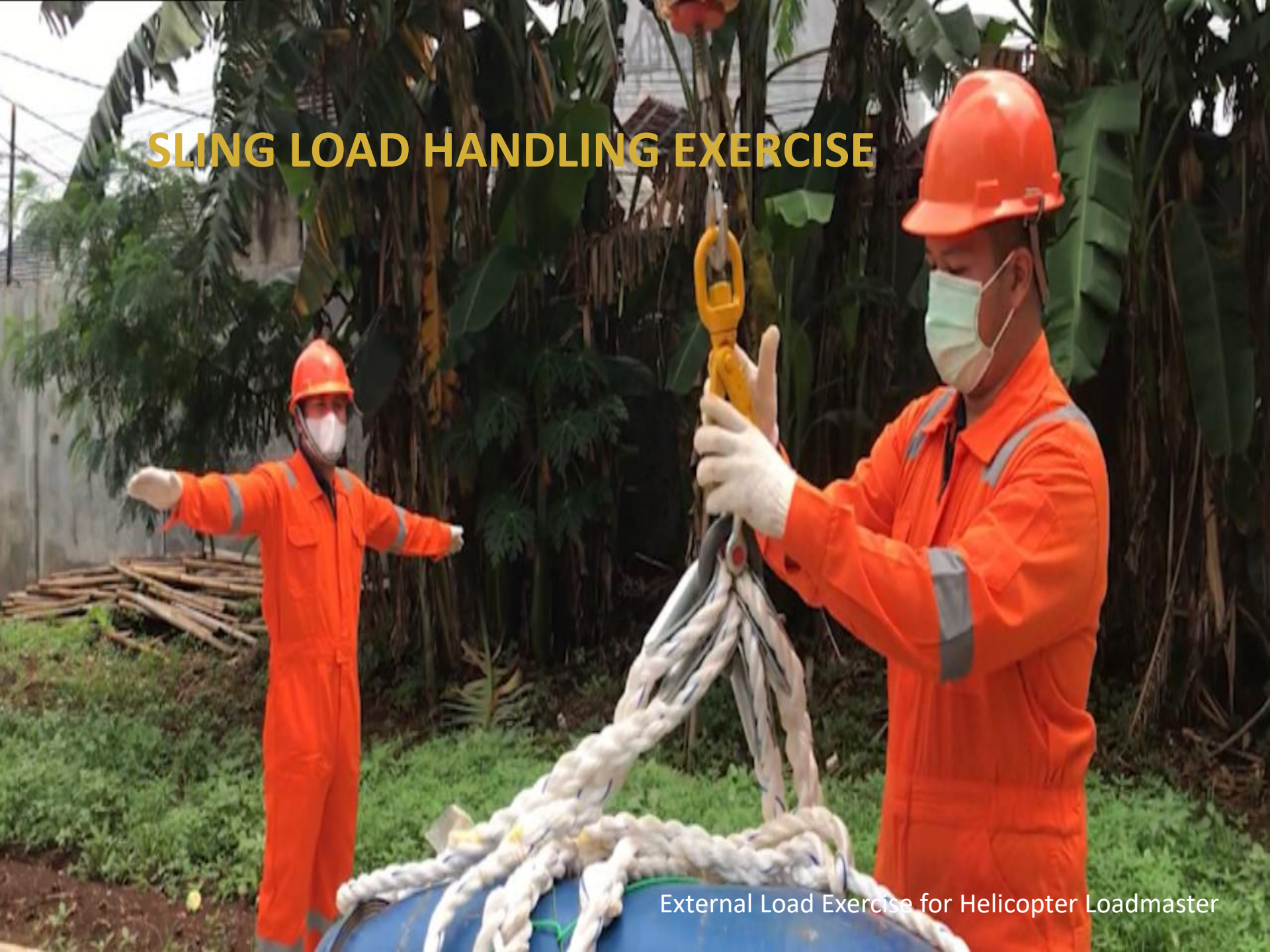
External Load Exercise for Helicopter Loadmaster