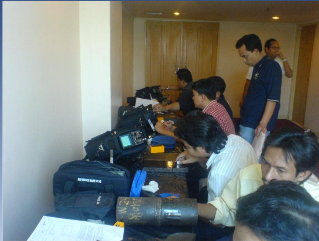
Survey and Inspection